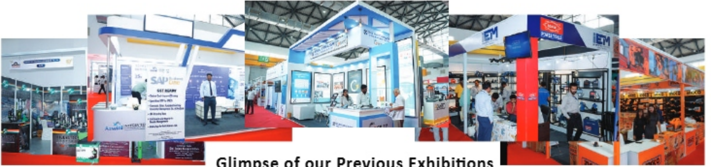
Glimpse of our Previous Exhibitions

At INDOMACH, we are committed to helping our exhibitors and visitors grow their business, forge new partnerships, and maximize ROI through well-organized, high-impact events. We've successfully hosted editions in Nagpur, Hyderabad, and Jamshedpur, each delivering top-tier infrastructure, security, and logistical support, making INDOMACH a trusted name in India's industrial expo landscape.